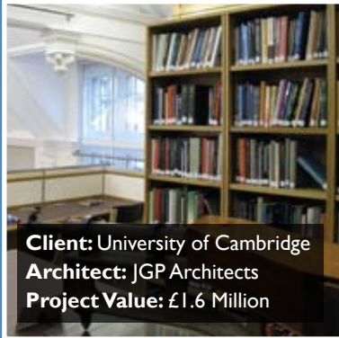
Client: University of Cambridge Architect: JGP Architects Project Value: £1.6 Million