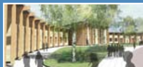
Ynysowen Primary School, Aberfan