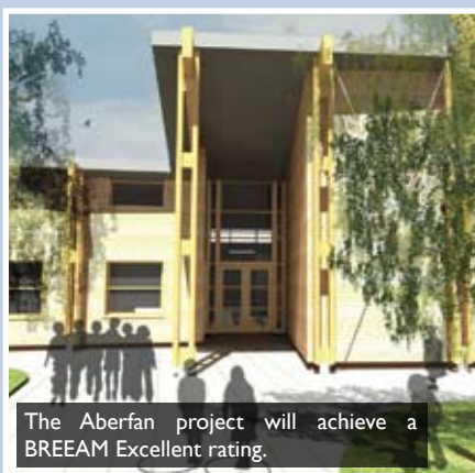
The Aberfan project will achieve a BREEAM Excellent rating.

full Thermal and Daylight Analysis in order to implement a number of design initiatives with the aim of producing a low energy building with the lowest possible carbon footprint."