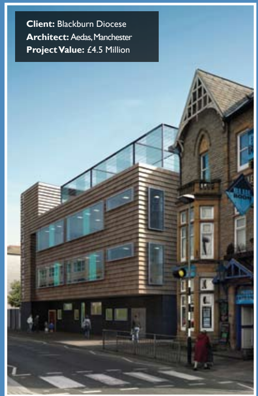
Client: Blackburn Diocese Architect: Aedas, Manchester Project Value: £4.5 Million

The school is due for completion in September 2009.