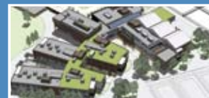
Filton High School