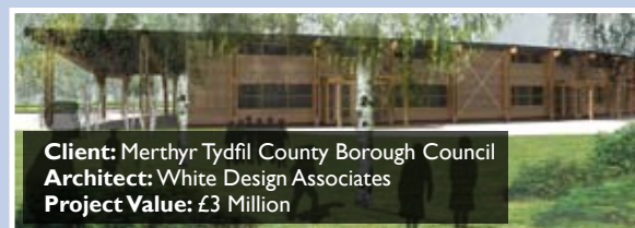
Client: Merthyr Tydfil County Borough Council Architect: White Design Associates Project Value: £3 Million