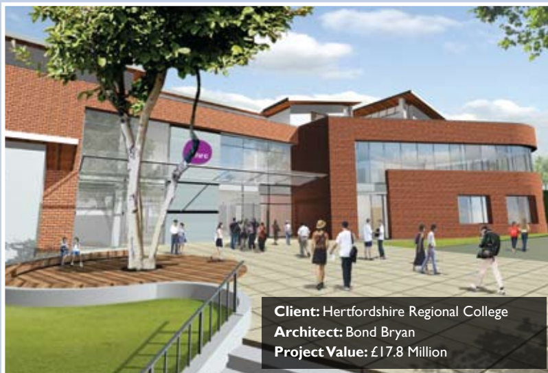
Client: Hertfordshire Regional College Architect: Bond Bryan Project Value: £17.8 Million